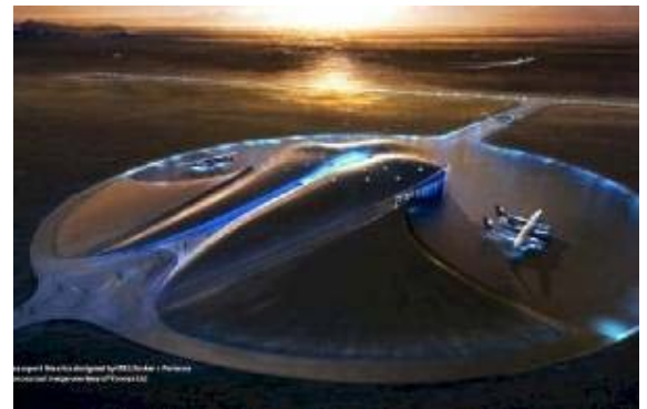
Terminal Hanger Concept, Spaceport America, in New Mexico. Sir Shults attended the groundbreaking ceremony on June 19, 2009.

On June 29, 2009, Sir Charles Shults joined me on the Free Energy Now radio show.